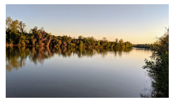
The proposed MVP Southgate project will use a horizontal directional drill to cross below the bed of the Dan River in order to avoid potential impacts on the waterbody.

Due to the distance between the Project and the Jordan Lake impoundment and the proposed surface water protection measures, no impacts would be expected to Jordan Lake's water quality or function. (Page 4-43)